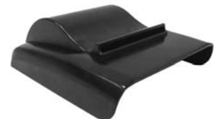
Spill Protect Cover