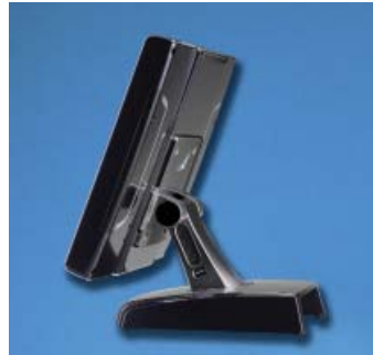
Slim Design – Small Footprint – Detachable Head for Ease of Serviceability – Additional USB Port on Left Side Standard