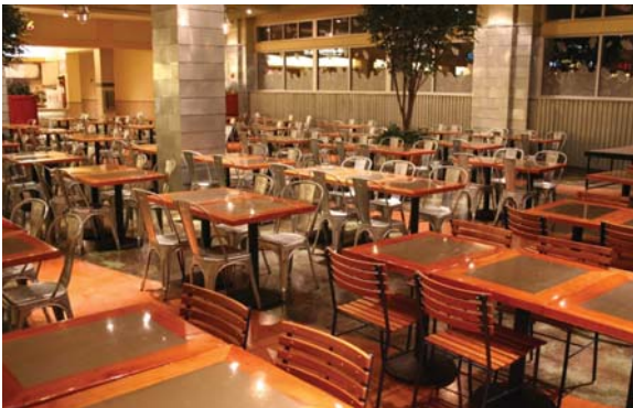
Quick Service Restaurants / Food Court Restaurants