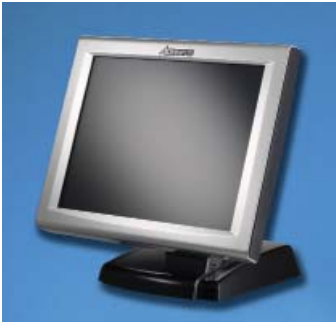
Color Bezel/Frame Combinations: Black/Black, Red/Black, Silver/ Black (Shown), Silver/Silver and Blue/Silver