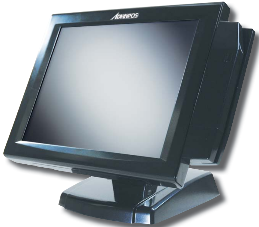
Shown with optional integrated card reader.