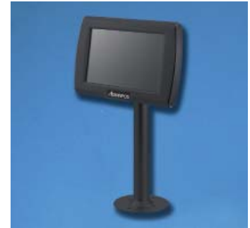
Optional Stand-Alone 8.9" LCD Customer Display