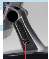
Additional USB Port on Left Side Standard