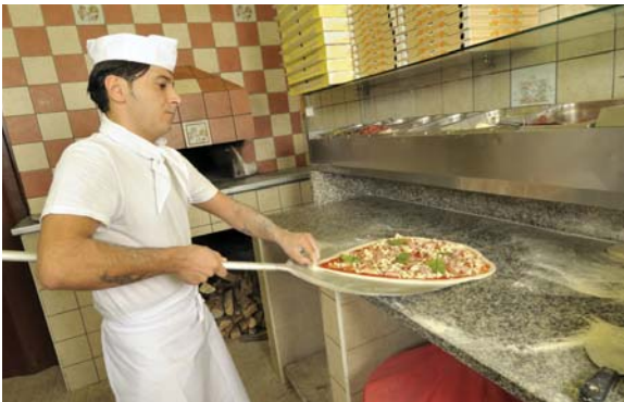
Dusty Environments Like Pizza and Bakeries